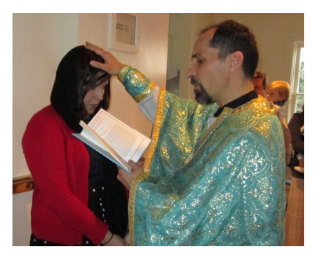
5: A New Catechumen

with any midshipman or St. John's student who is struggling or would like to grow in their Orthodox Faith, or come to a deeper knowledge and love of Christ and His holy Orthodox Church.