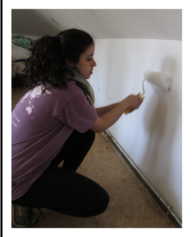
midshipmen from the Naval Academy! Realbreak gives these students an opportunity to do something positive with their Spring Break to grow in Christ and give come outside themselves to serve in His Name. We traveled to Pro Vita orphanage in Romania where we spent time sharing the

In March, I led the OCF Realbreak Romania trip for eleven college students from around the country, including for the first time, two