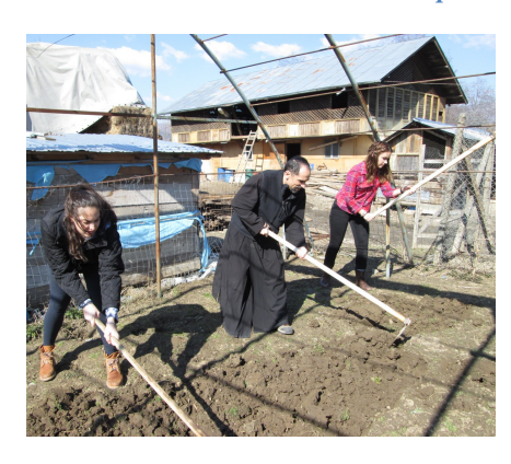
8: Hoeing the field in Valea Screzii, Romania - One of many work project