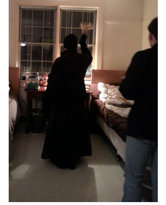
2: Annual Blessing of Dorms

Blessed Pascha! Christ is risen! Indeed, He is risen! Dear Friends of Annapolis Pan-Orthodox College Ministry: