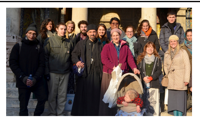
6: Our OCF Realbreak Romania Student Group

Once Great Lent began, the students participated in the Wednesday Presanctified Liturgies on campus . Students help set up the worship space for Orthodox use and avail themselves of the timeless worship of Christ's holy Church for their edification and strengthening and growth in the knowledge and love of Christ and participation in the Sacraments.